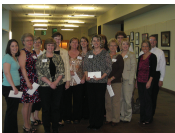
Left: All of the grant recipients

Fifteen nonprofit organizations will receive funding to promote early childhood literacy in their communities. Congratulations to those entities serving Spencer County with their grant: 4-C's of Southern Indiana, Cornerstone United Methodist Church Preschool in Chrisney, Lincoln Hills Development Corporation and North Spencer County School Corporation.